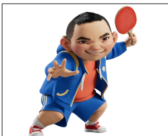
Space Ping-Pong A fun, floating game

When the character Fei Fei travels to Lunaria (a mythical world on the moon), she finds: