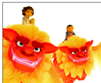
Flying Lions Gentle giants kids can ride