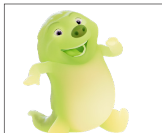
Gobi A glowing space creature