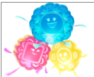
Mooncakes Friendly pastries come to life