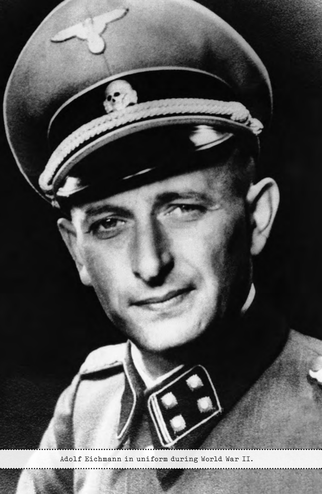
Adolf Eichmann in uniform during World War II.