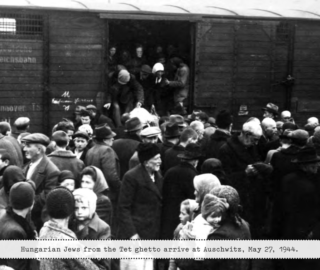
Hungarian Jews from the Tet ghetto arrive at Auschwitz, May 27, 1944.