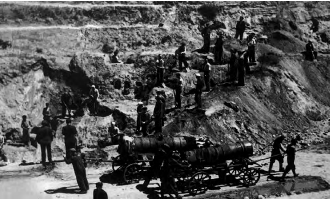
Jewish laborers are forced to work in a mine near Lodz, Poland.