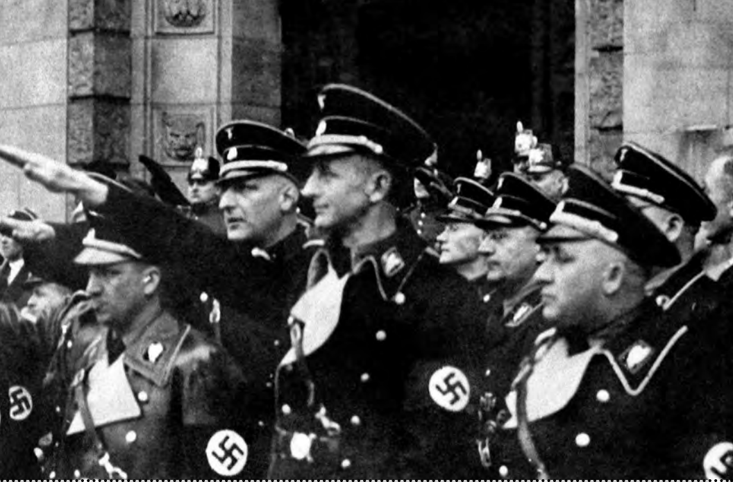
Obersturmbannführer Adolf Eichmann of the SS, with top Nazi brass.

Jews and formulating plans to move them to Palestine — the preferred Nazi answer to “the Jewish question” at the time.