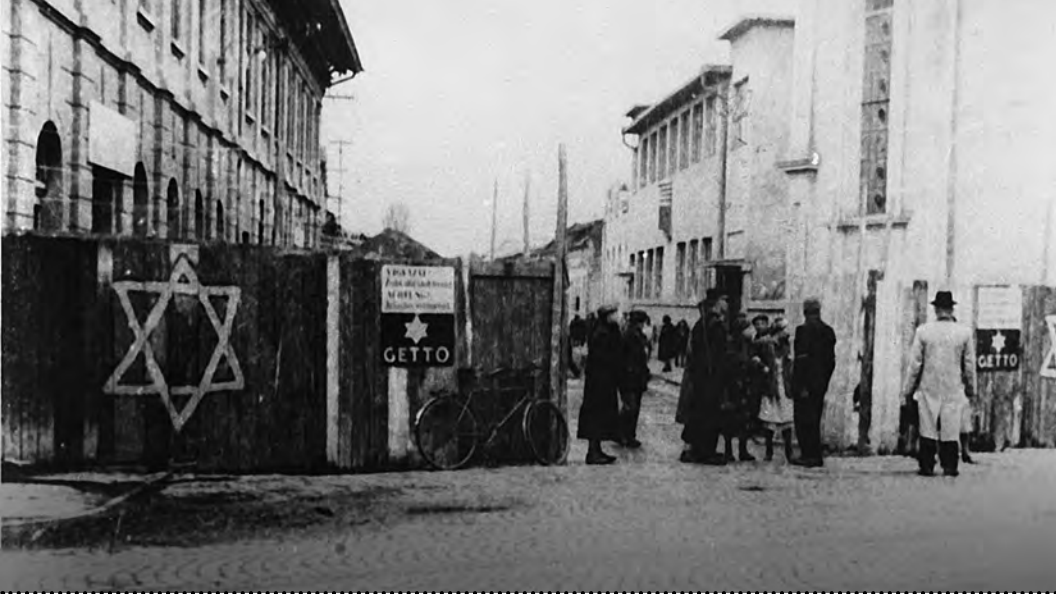
Hungarian gendarmes guard the entrance to the Munkács ghetto.