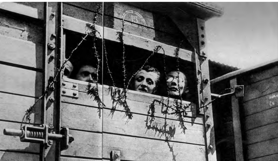
Jews are crowded into a cattle car and brought through France.