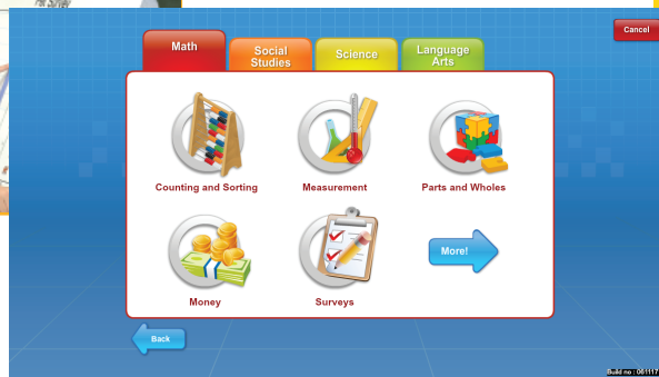
Over 100 cross-curricular activities in mathematics, social studies, science, and language arts