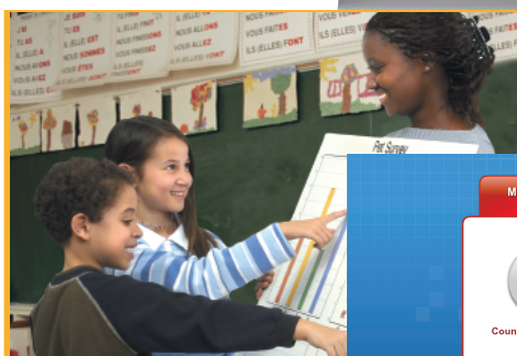
Students move from graphing with manipulatives to graphing in the abstract

Teach 5 graph types: picture, bar, circle, line, and table