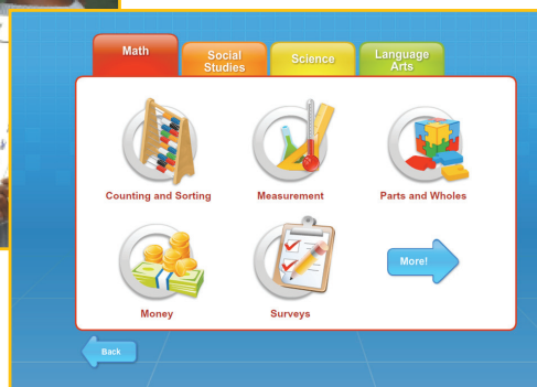
Over 100 cross-curricular activities in mathematics, social studies, science, and language arts