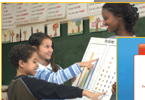
Students move from graphing with manipulatives to graphing in the abstract

Teach 5 graph types: picture, bar, circle, line, and table