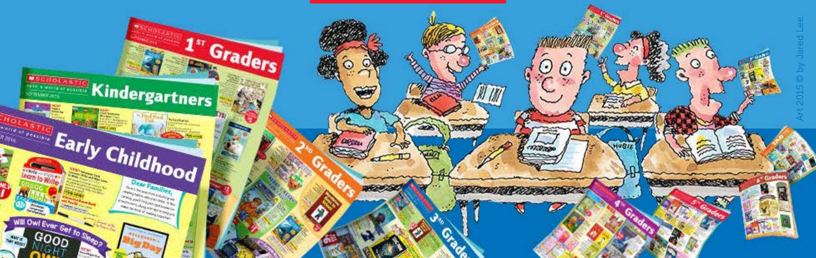
Art 2015 © by Jared Lee.